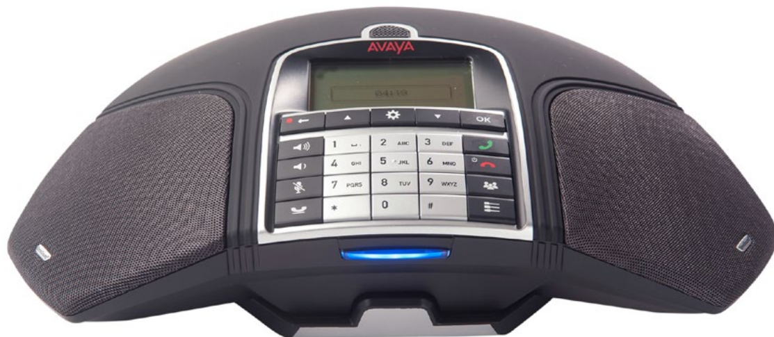
Avaya IX Conference Phone B199