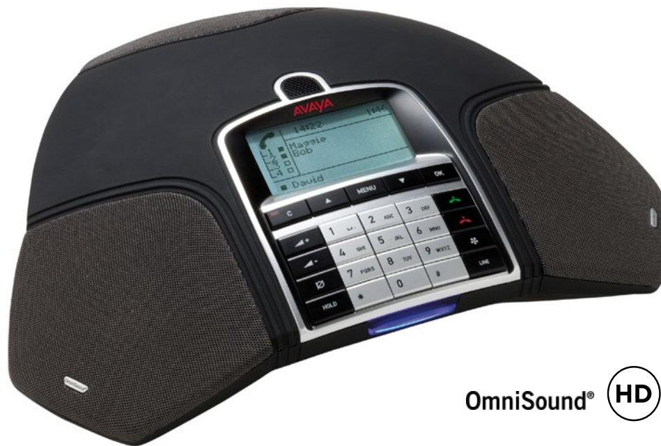
Avaya IX Conference Phone B199