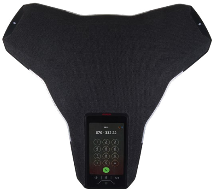
Avaya IX Conference Phone B189

Designed for meetings in mid-size to very large rooms