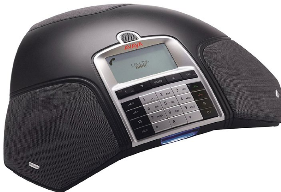
Avaya IX Conference Phone B199